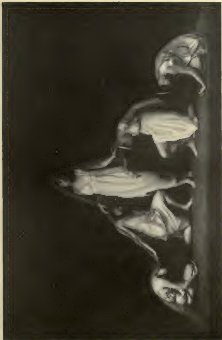
GROUPING. — By Florence Fleming Noyes